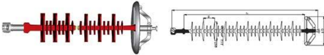
110kV(132kV) 棒形复合绝缘子示意图 110kV(132kV) Composite Long Rod Suspension Type Insulator Schematic Diagram